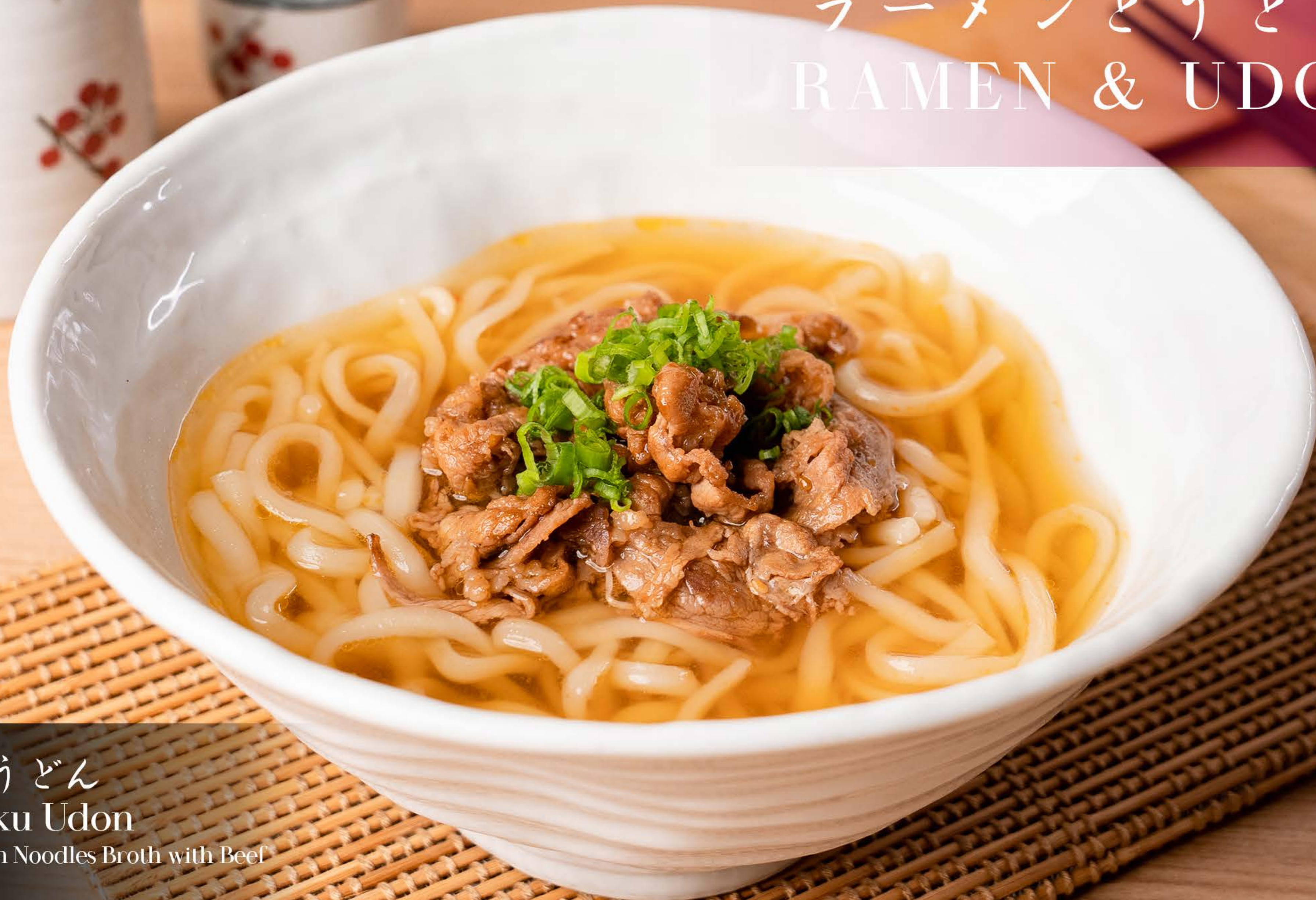
肉うどん Niku Udon Udon Noodles Broth with Beef $16