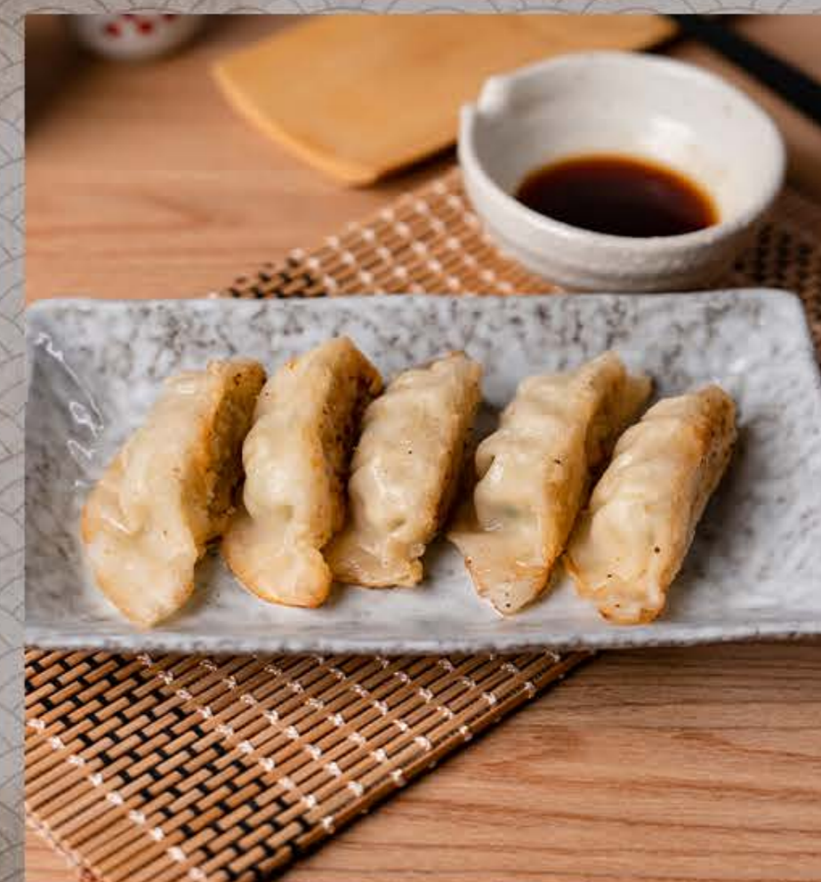
餃子 Gyoza Japanese Dumplings with Filling $10