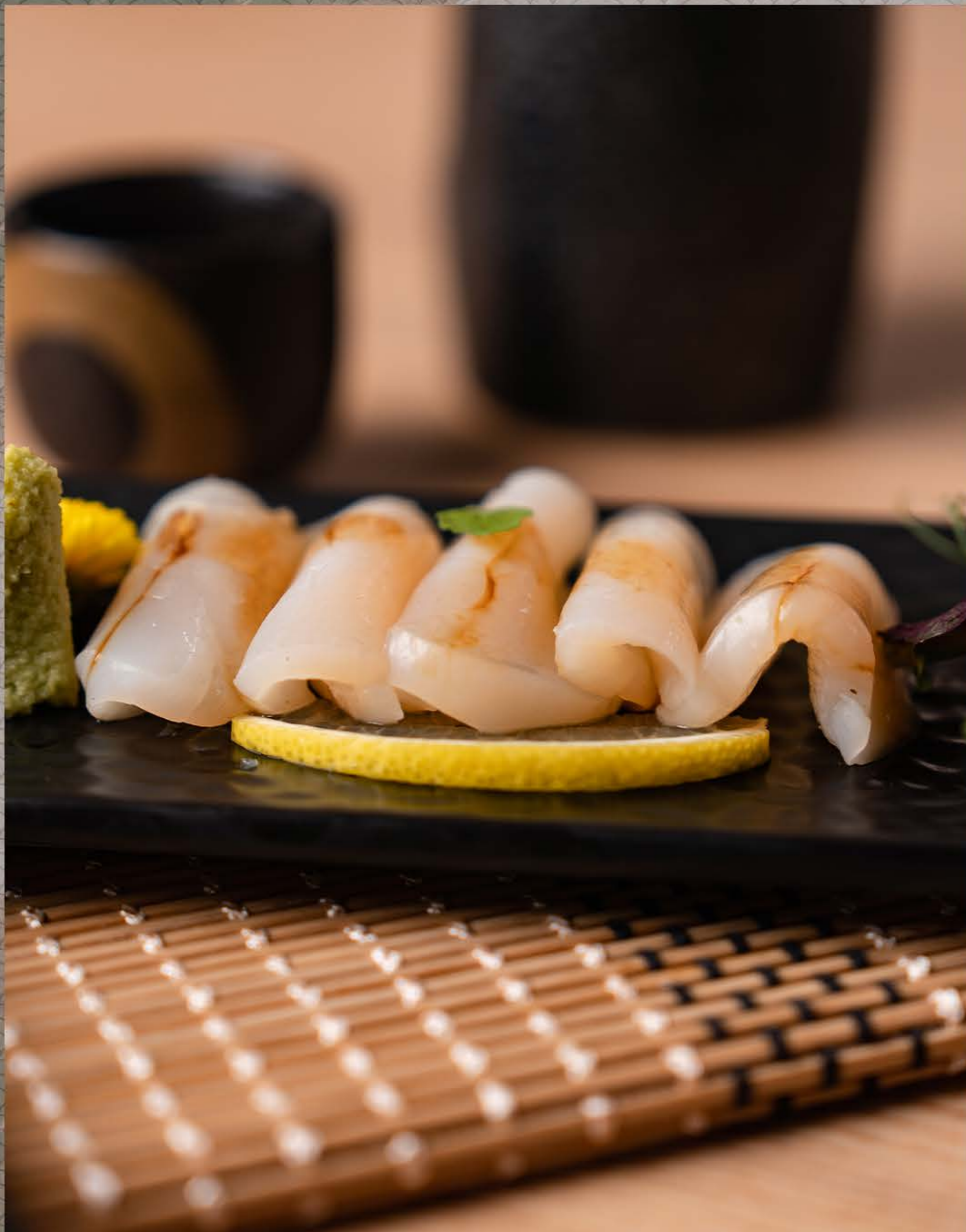
ホタテ Hotate Tender and Succulent Scallop Meat $18