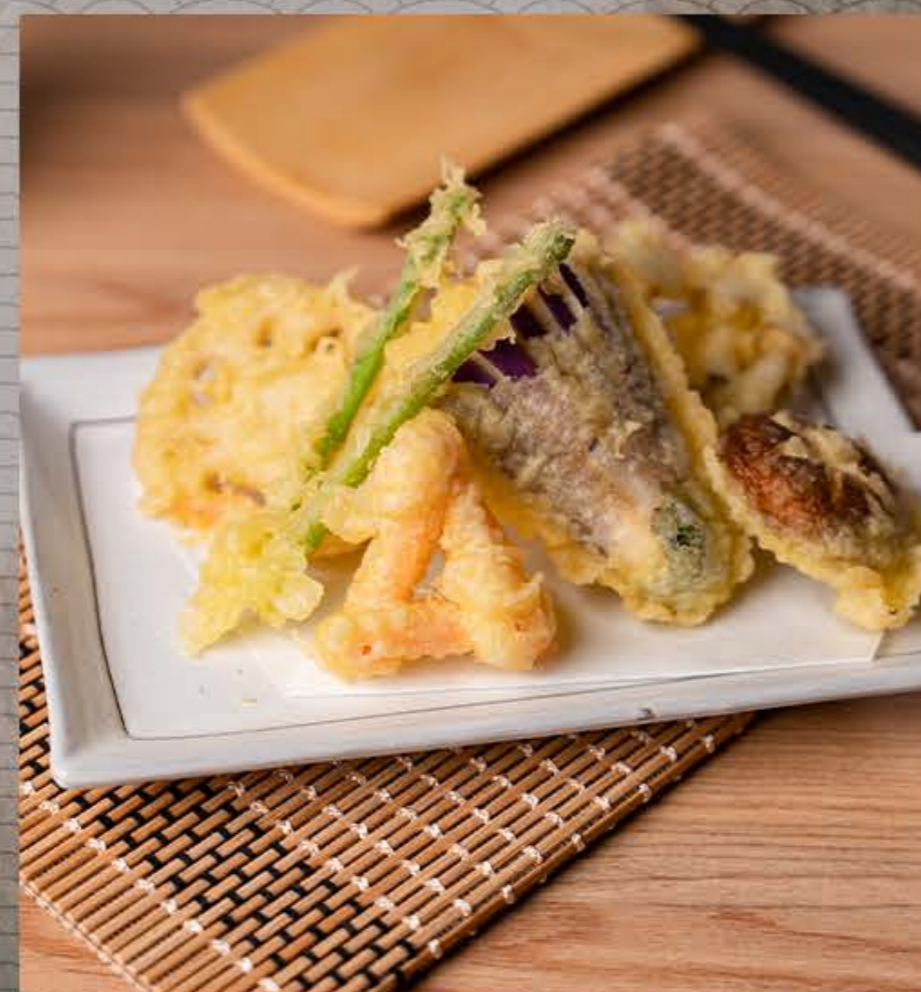
野菜天ぷら Yasai Tempura Assorted Vegetable Tempura $12