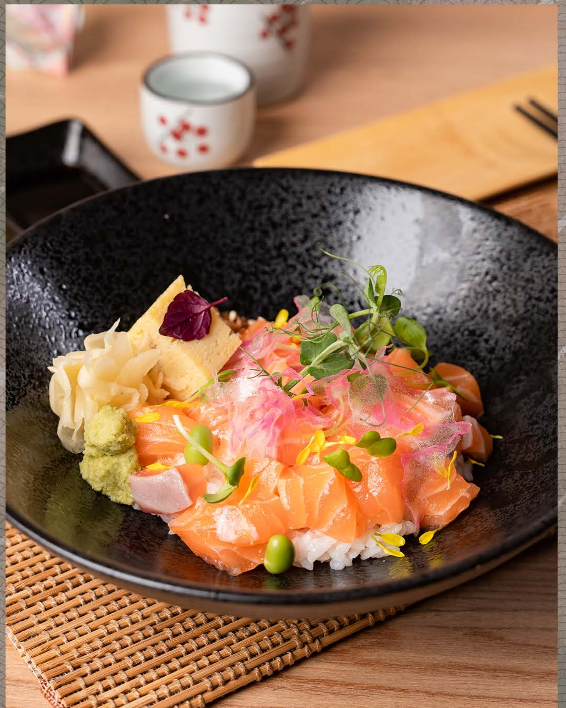
サーモンバラ Salmon Bara Diced Salmon over Rice $20