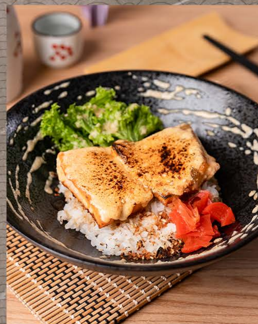
サーモン明太丼 Sake Mentai Don Salmon Bowl with Spicy Cod Roe $20