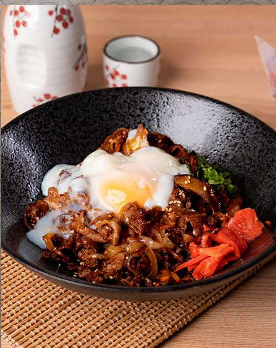
黒胡椒牛丼 Blackpepper Gyu Don Beef Bowl with Black Pepper $17