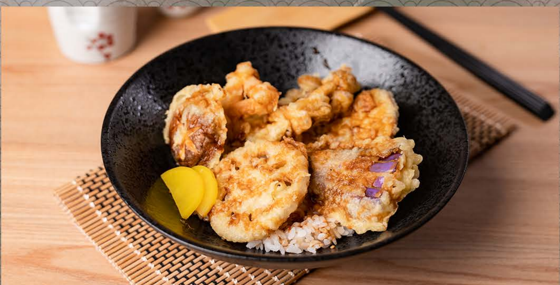
野菜天丼 Yasai Tendon Vegetable Tempura over Rice $12