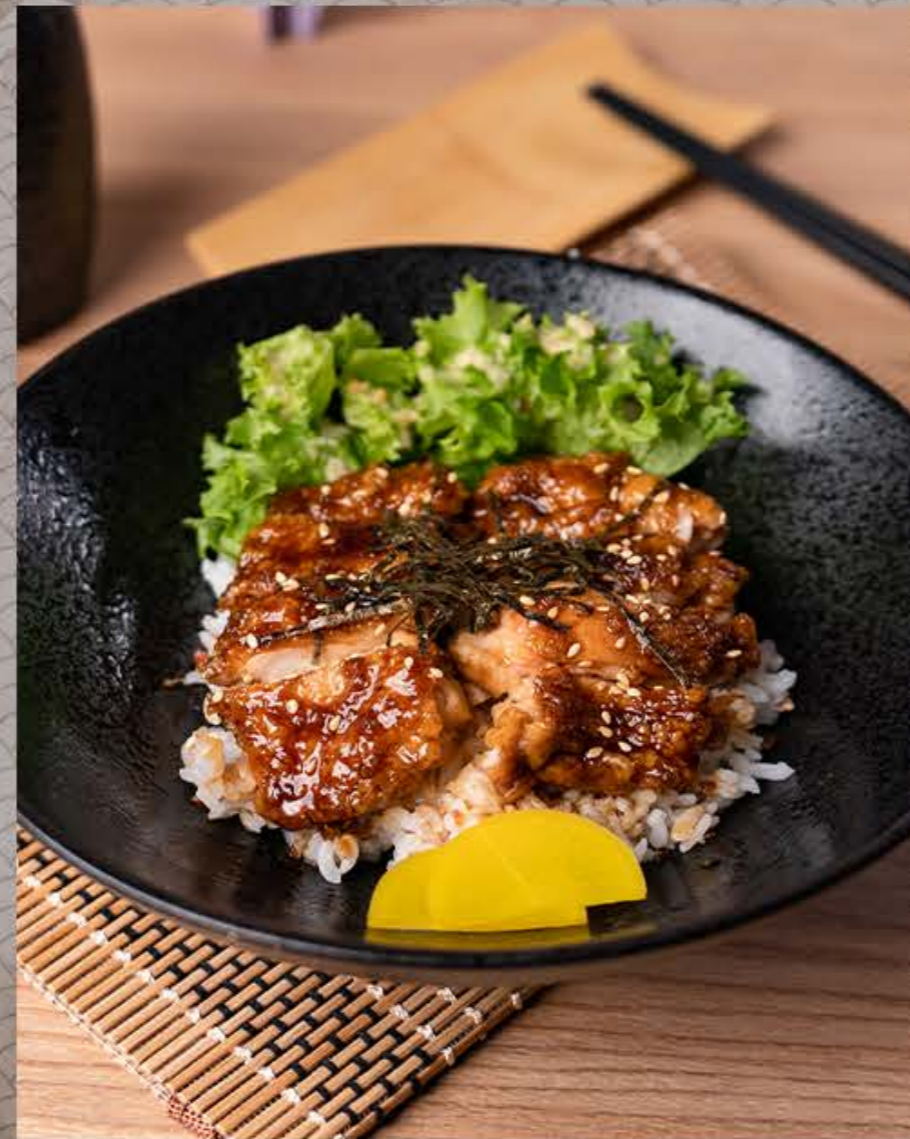
チキン照り焼き丼 Chicken Teriyaki Don Rice Bowl with Chicken Teriyaki $15