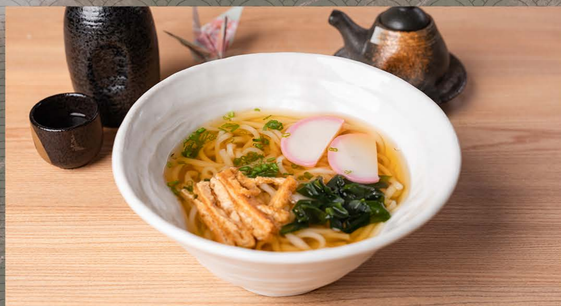
木の葉うどん Konoha Udon Flavorful Broth with Hearty Udon $12