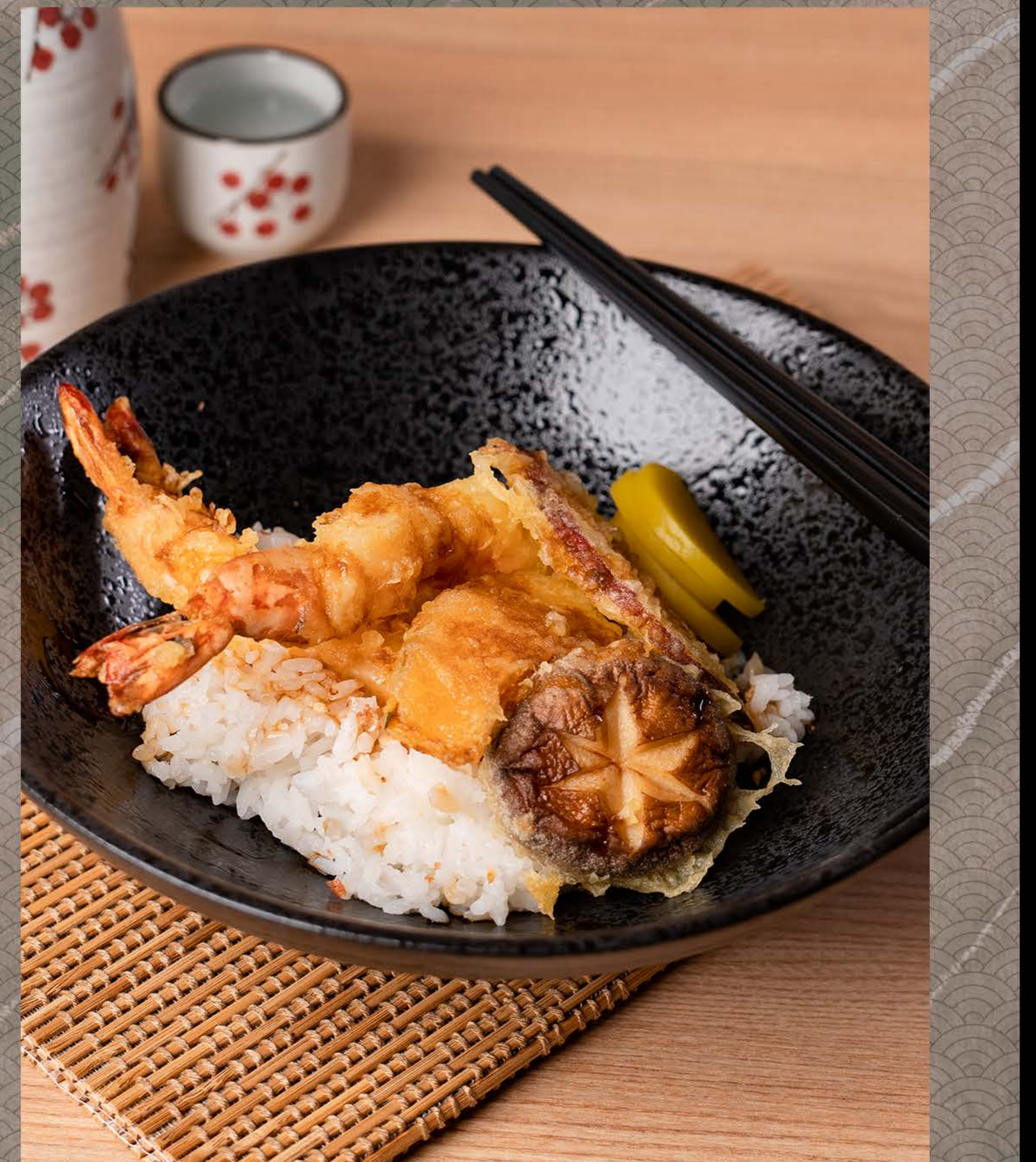
天丼 Tendon Assorted Tempura over Rice $17