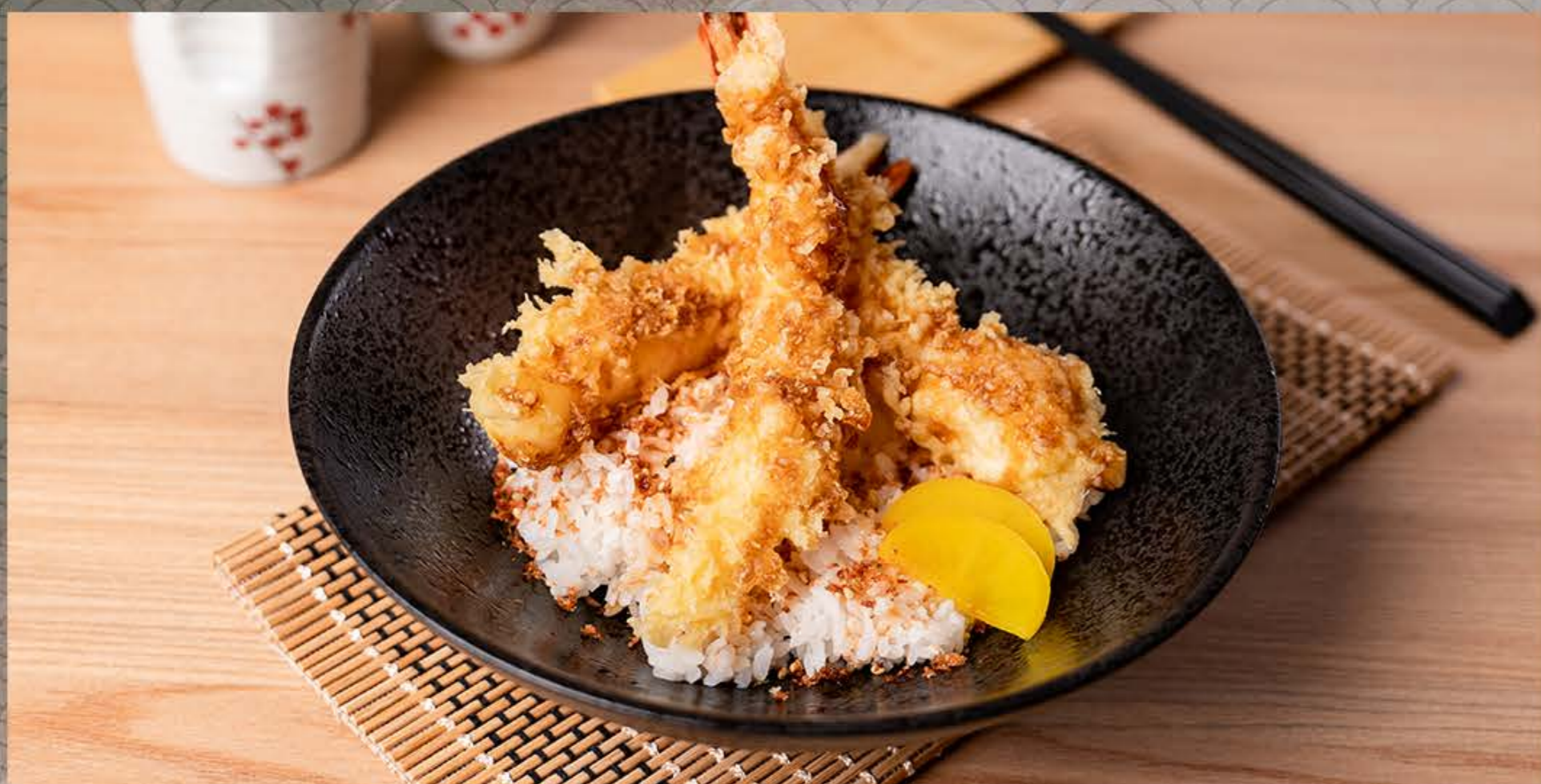
サーモンちらし Ebi Tendon Crispy Shrimp Tempura over Rice $17