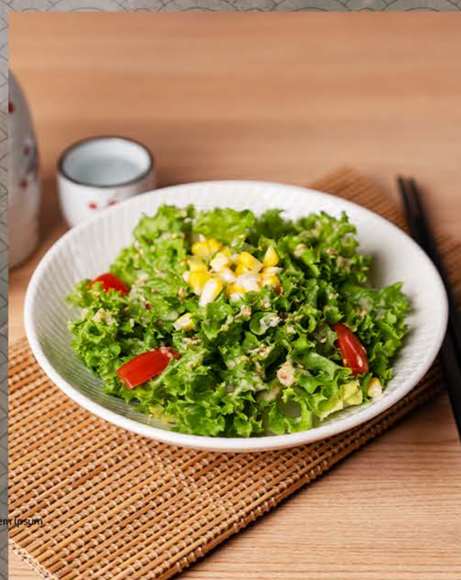
りんごサラダ Ringo Salad Apple Salad with Dressing $8