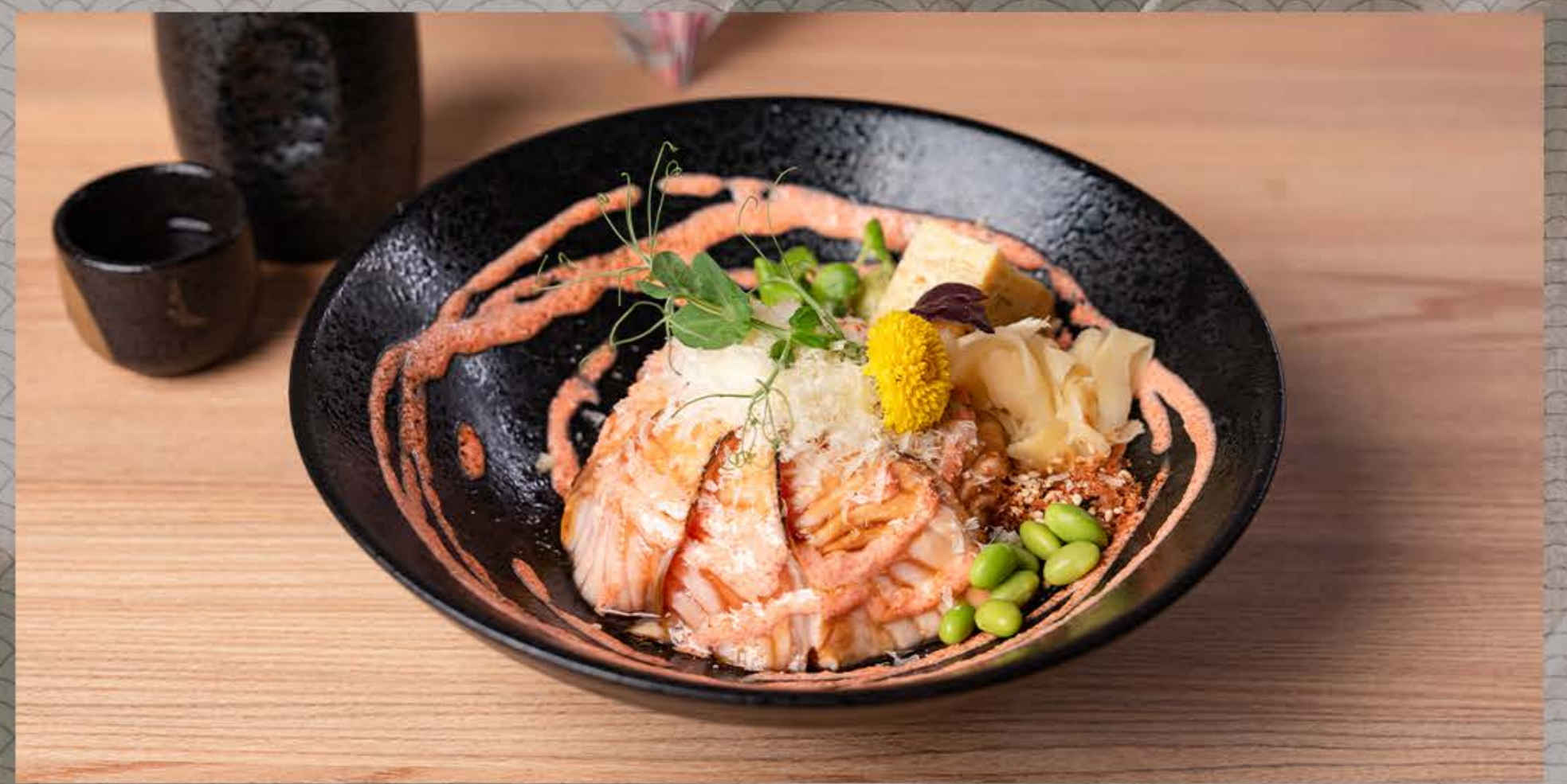
サーモンチーズ明太 Salmon Cheese Mentai Salmon with Cheese and Spicy Cod Roe $25