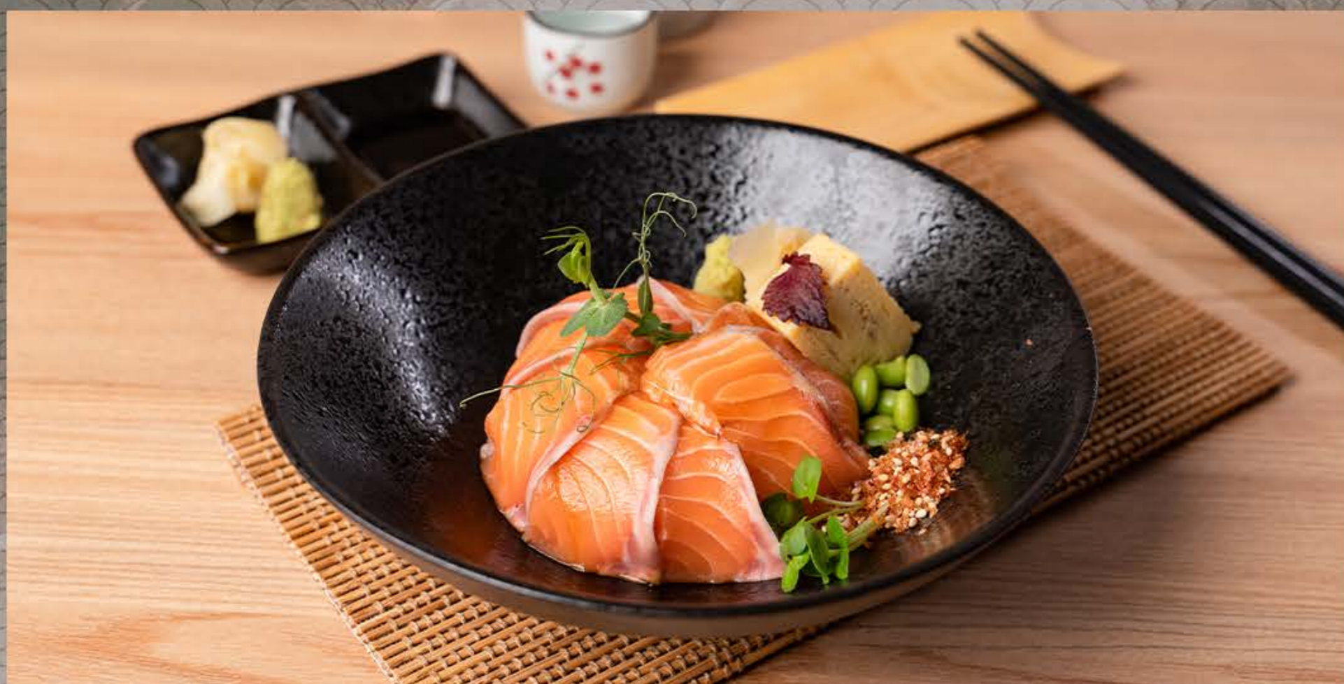
サーモンちらし Salmon Chirashi Salmon Slices over Rice $22