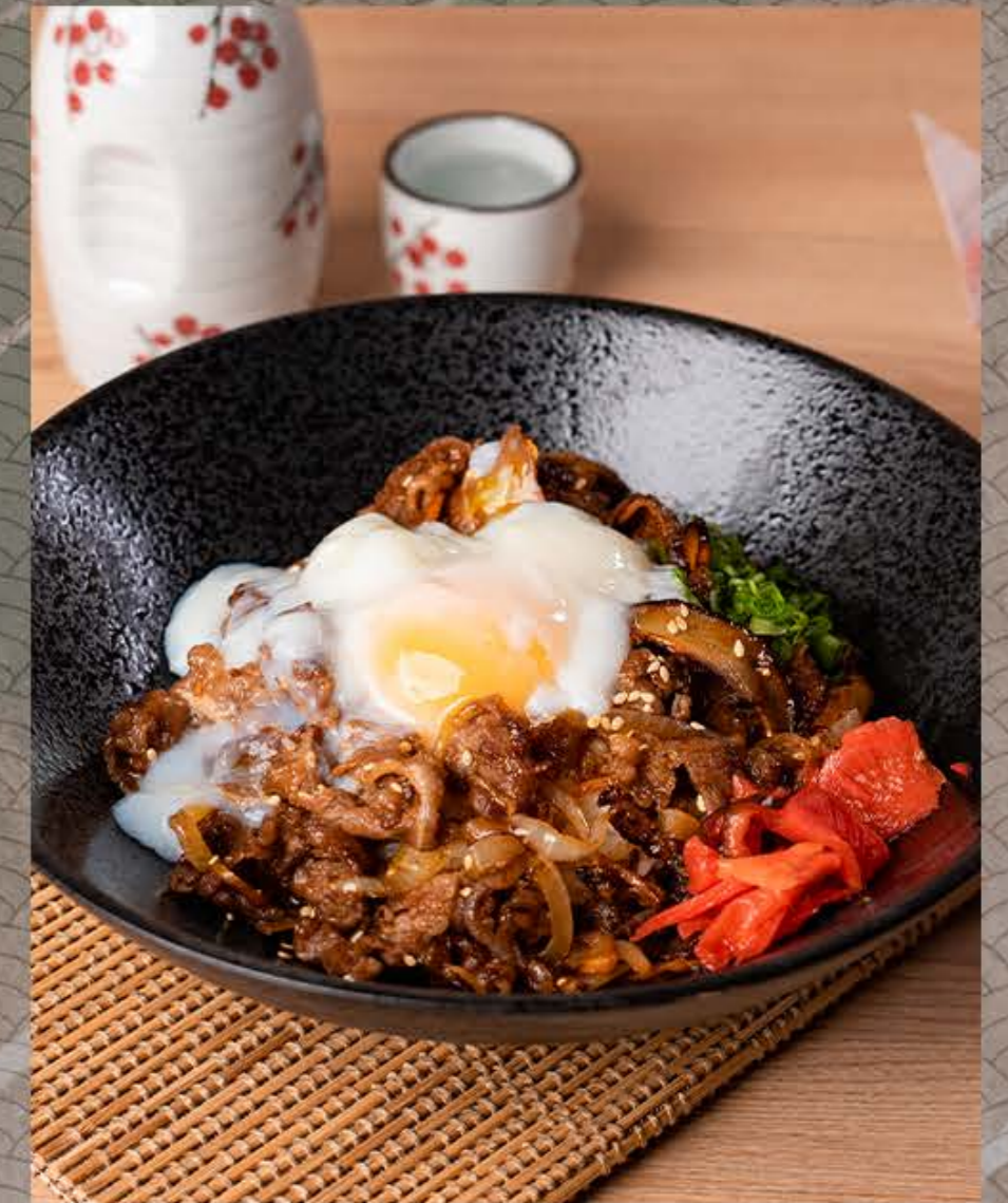
焼肉丼 Yakiniku Don Rice Bowl with Grilled Beef $16