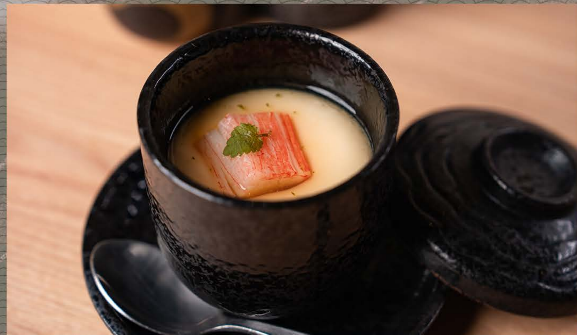
茶碗蒸し Chawan Mushi Steamed Japanese Egg Custard $5