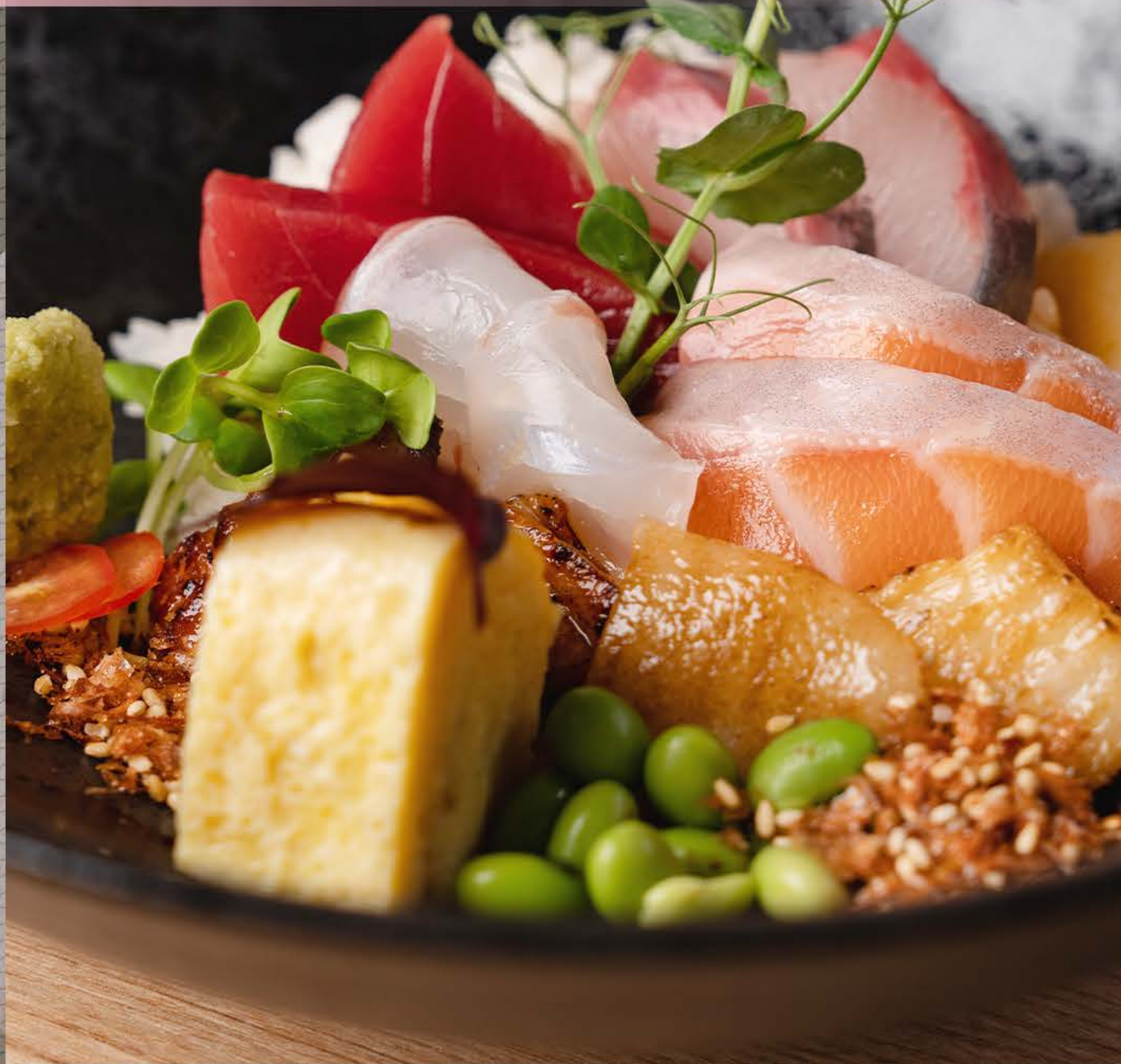
ちらし丼 Chirashi Don Assorted Sashimi over Rice $32