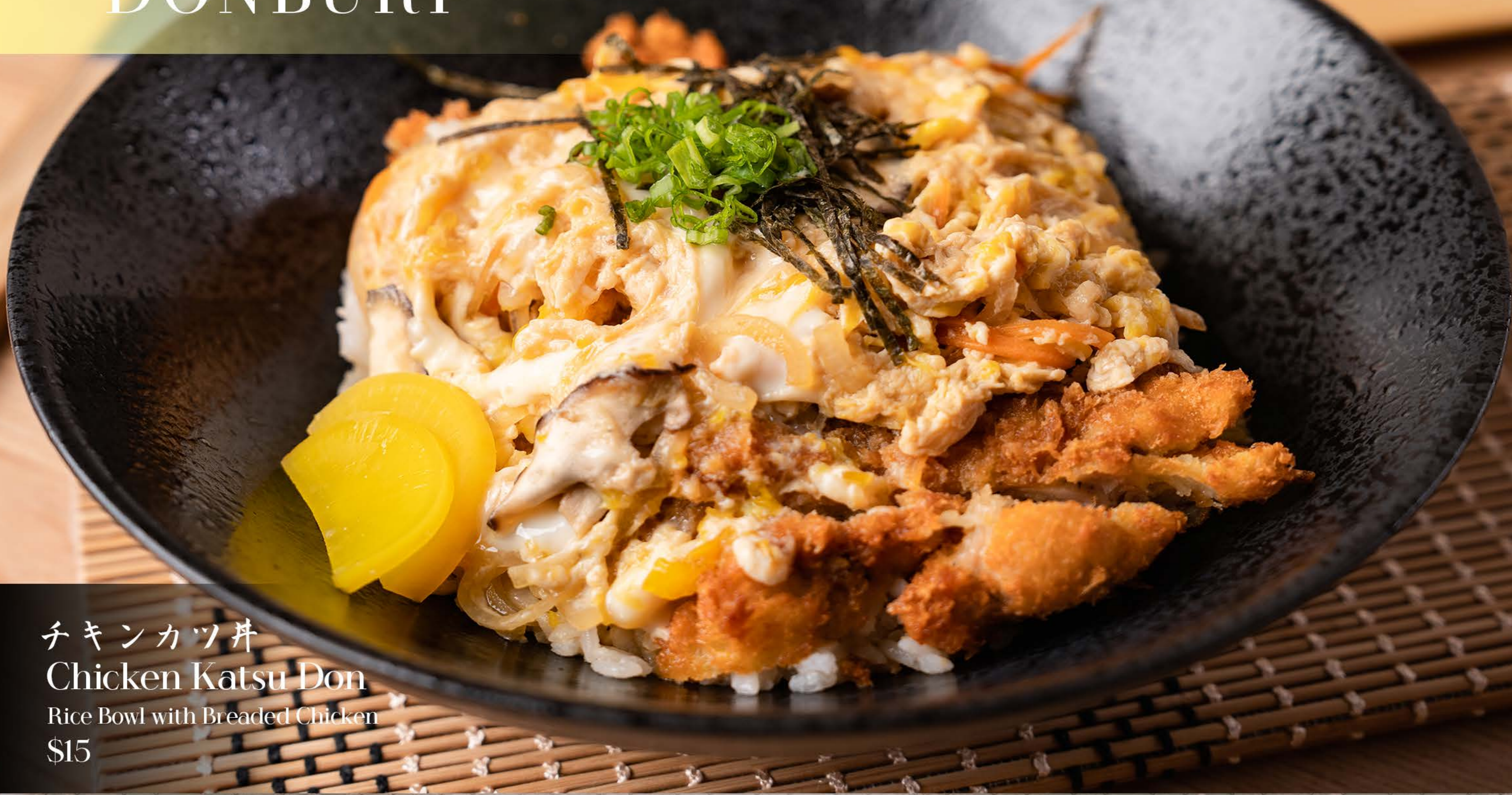
チキンカツ丼 Chicken Katsu Don Rice Bowl with Breaded Chicken $15