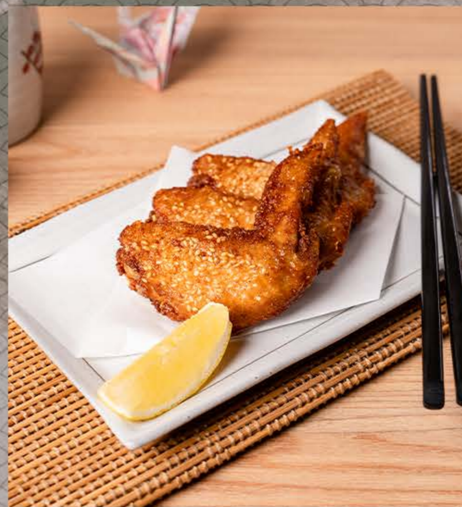
ごま手羽先 Goma Tebasaki Sesame-flavored Chicken Wings $10