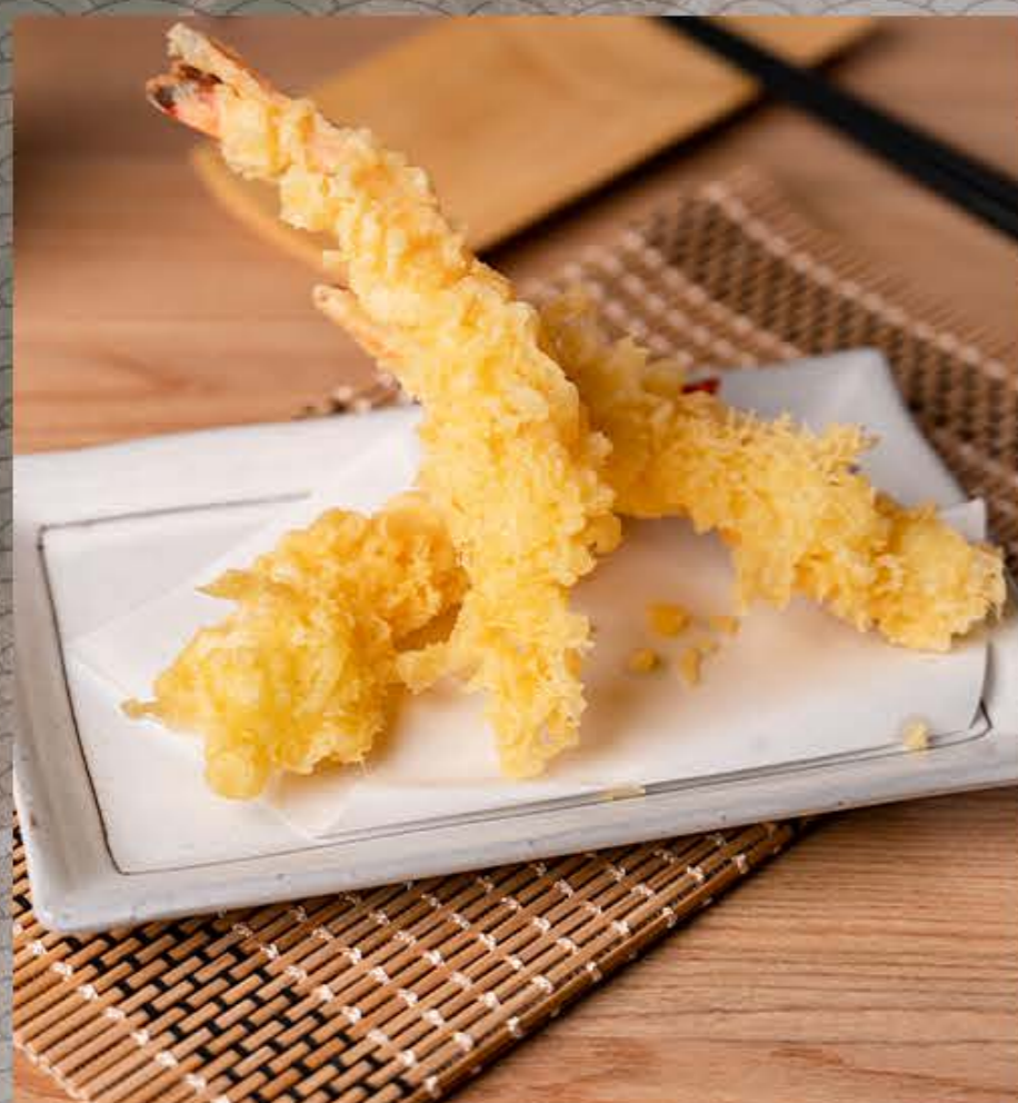
エビ天ぷら Ebi Tempura Crispy Shrimp Tempura $15