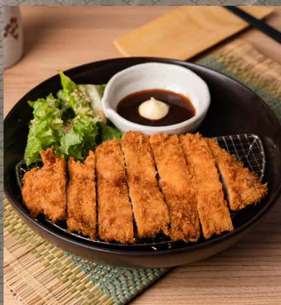
チキンカツ Chicken Katsu Crispy Breaded Chicken Cutlet $12