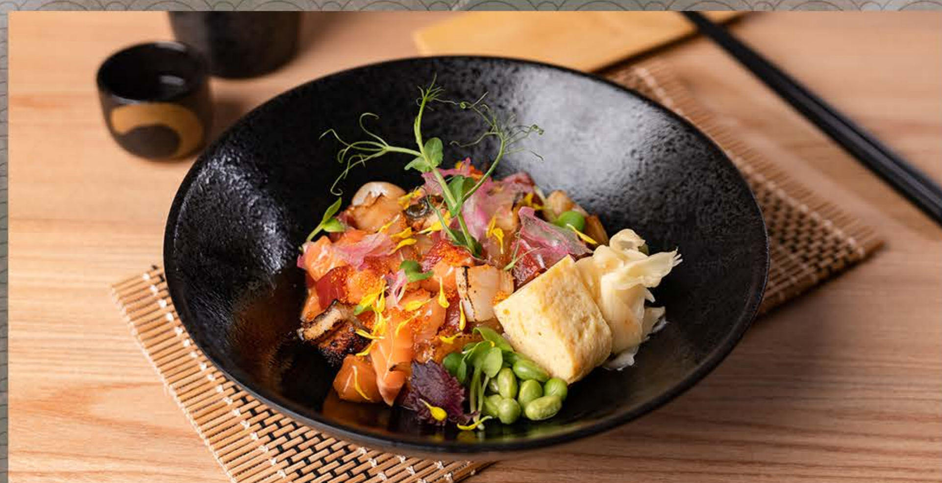
バラちらし Bara Chirashi Assorted Diced Sashimi over Rice $28