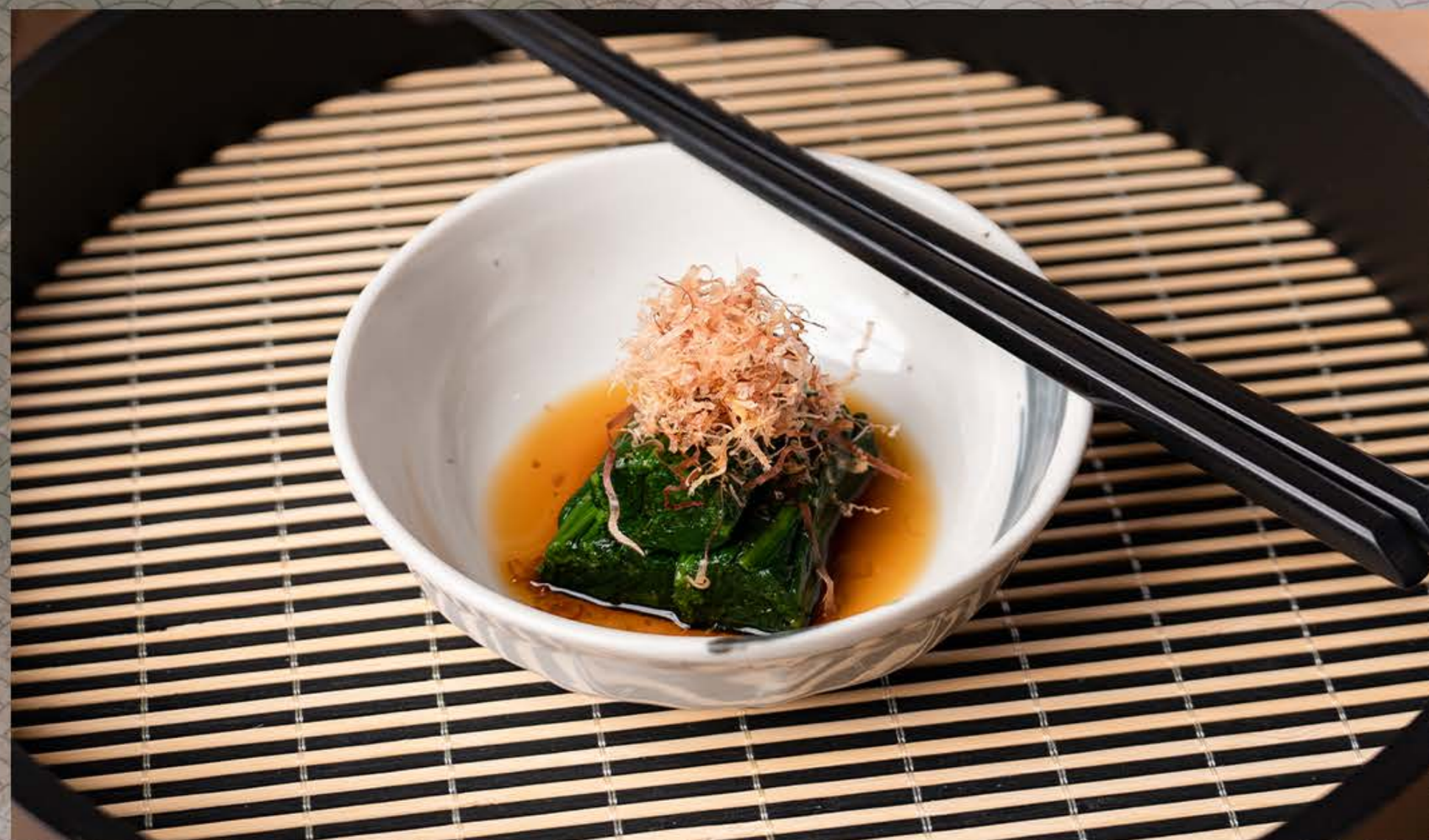
ほうれん草お浸し Horenso Ohitashi Spinach with Soy Dressing $5