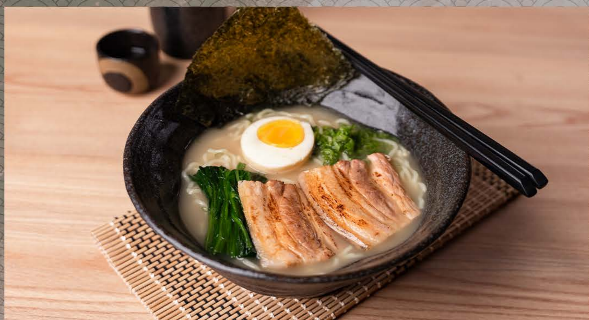
塩ラーメン Shio Ramen Light and Delicate Salt-based Ramen $16