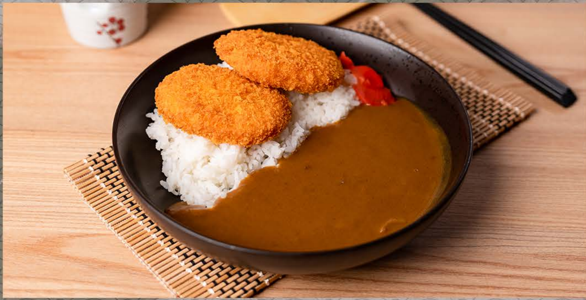
コロッケカレー Croquette Curry Curry with Crispy Potato Croquettes $12