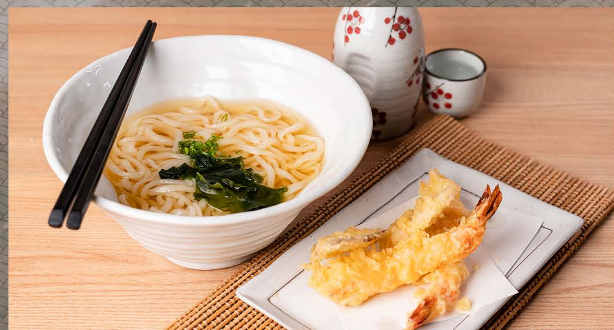
天ぷらうどん Tempura Udon Udon with Crispy Tempura $20