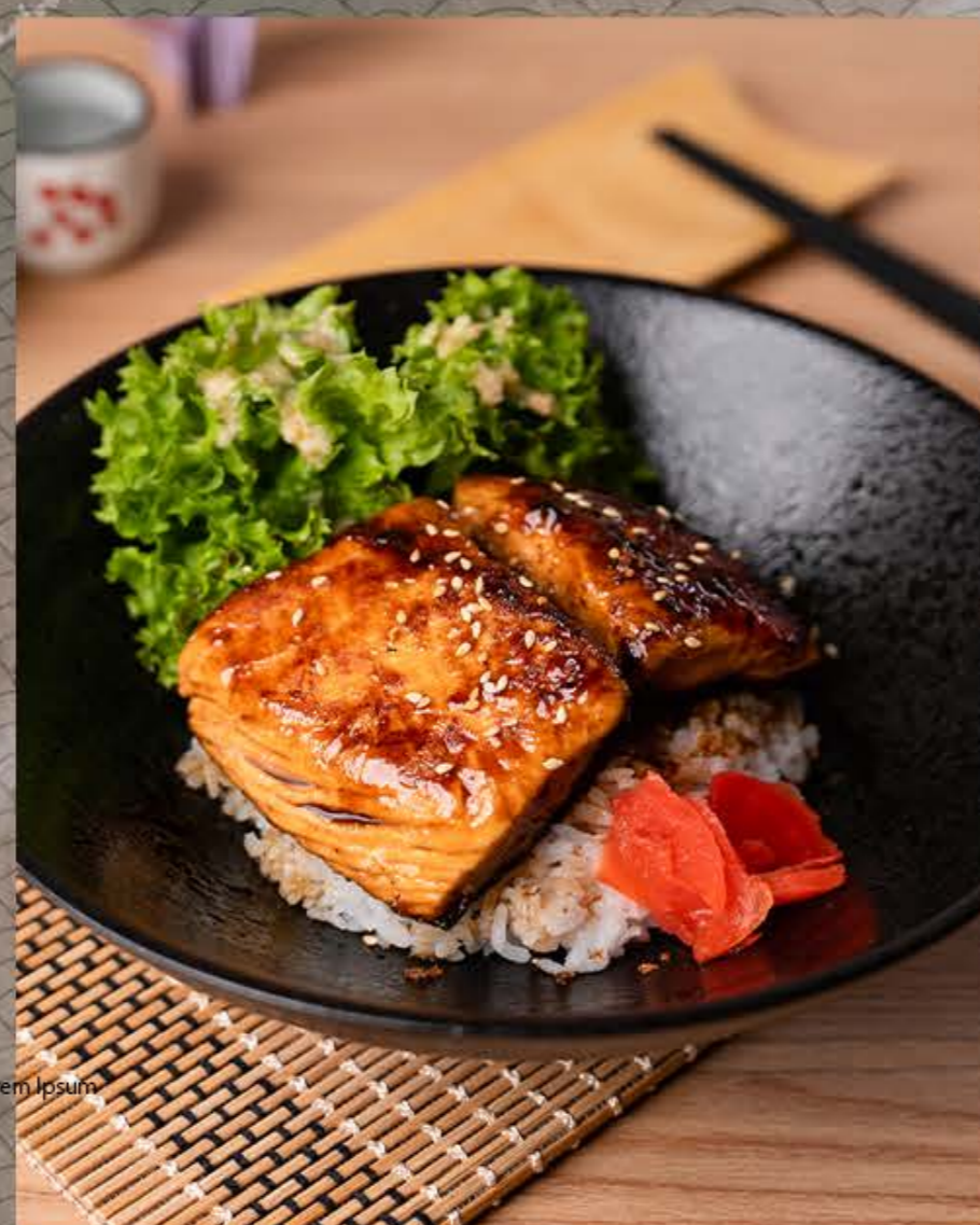
サーモン照り焼き丼 Salmon Teriyaki Don Salmon Teriyaki Sauce Bowl $18