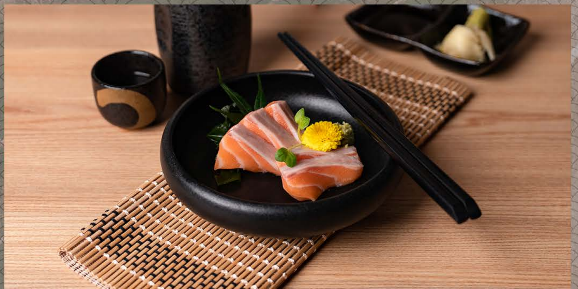
サーモン Salmon Rich, Flavorful, and Fatty Fish $15