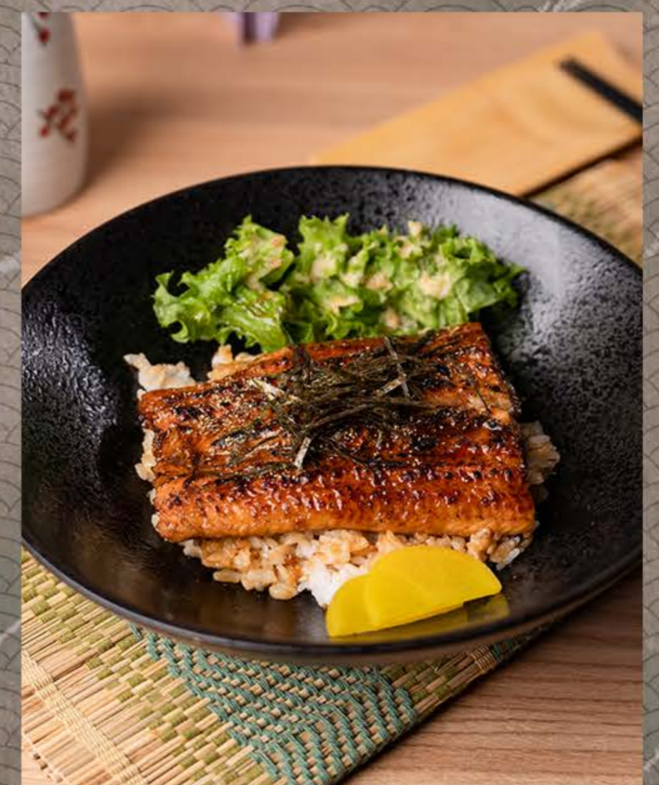
うな丼 UnaDon Grilled Eel over Rice Bowl $20