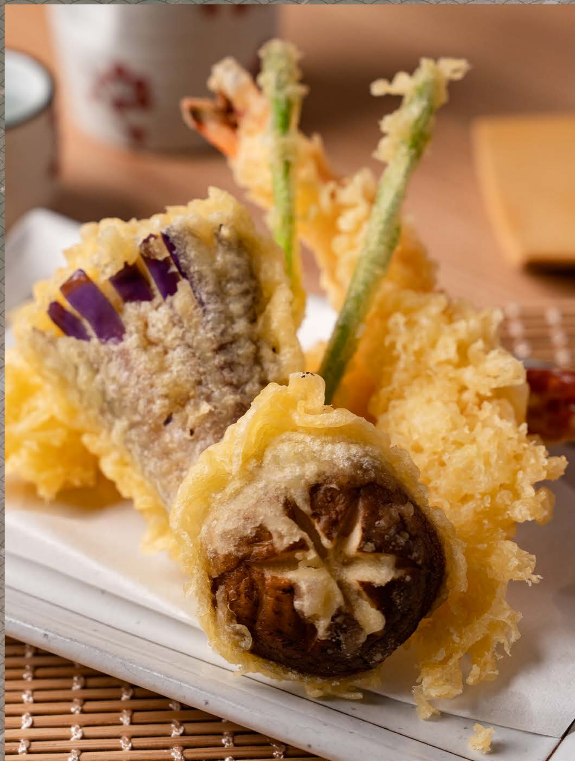
天ぷら盛り合わせ Tempura Moriawase Assorted Crispy Tempura Selection $15