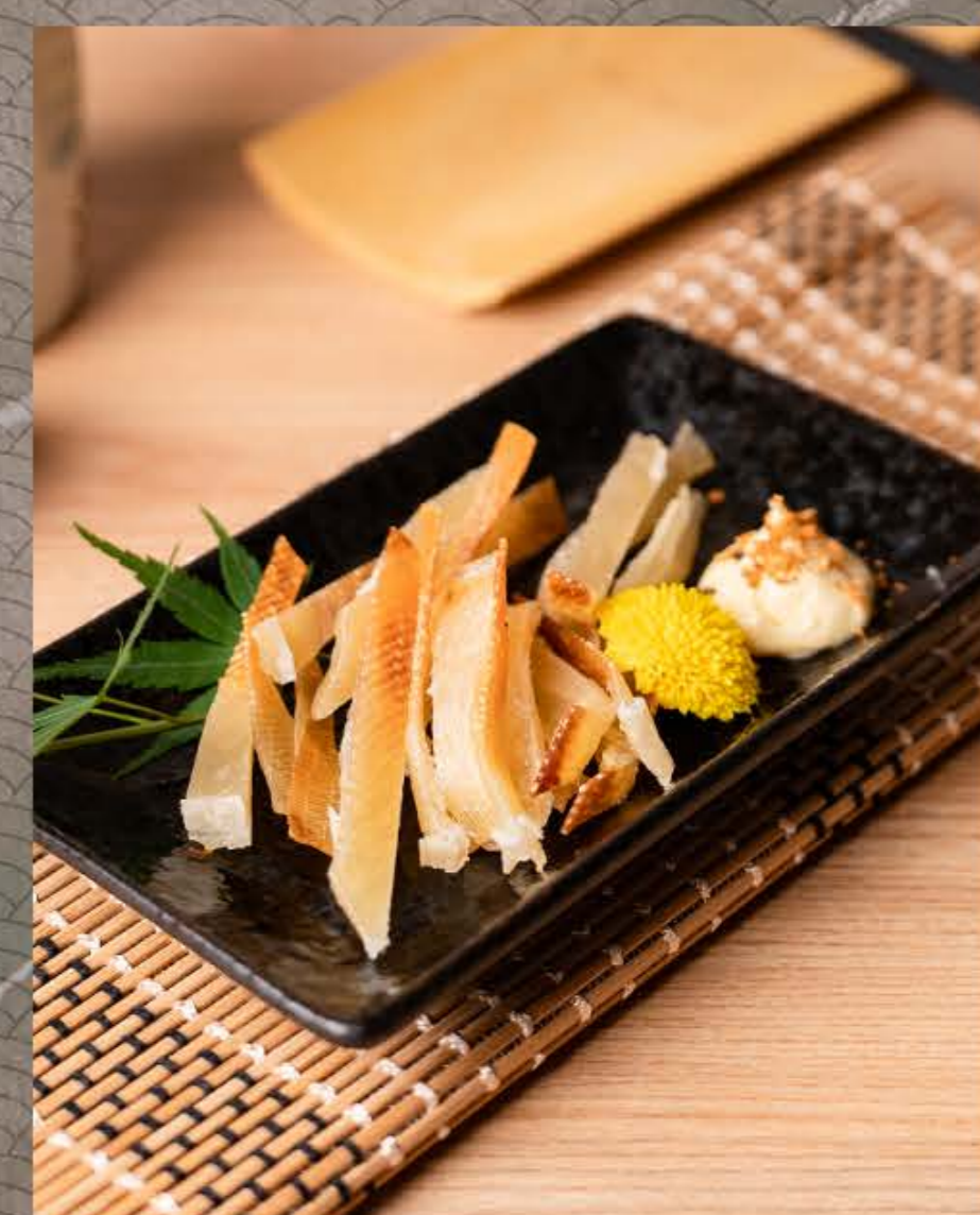
エイヒレ Eihirei Grilled ray fin snack $8