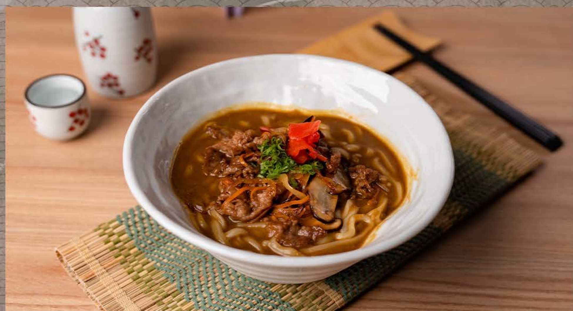
カレー肉うどん Curry Niku Udon Udon Noodles with Curry and Beef $18