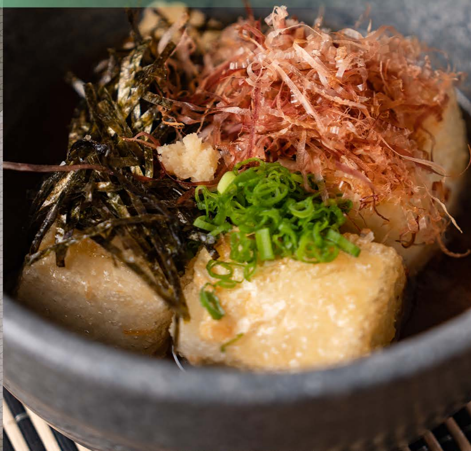
揚げ出し豆腐 Agedashi Tofu Crispy Deep-Fried Tofu with Broth $8