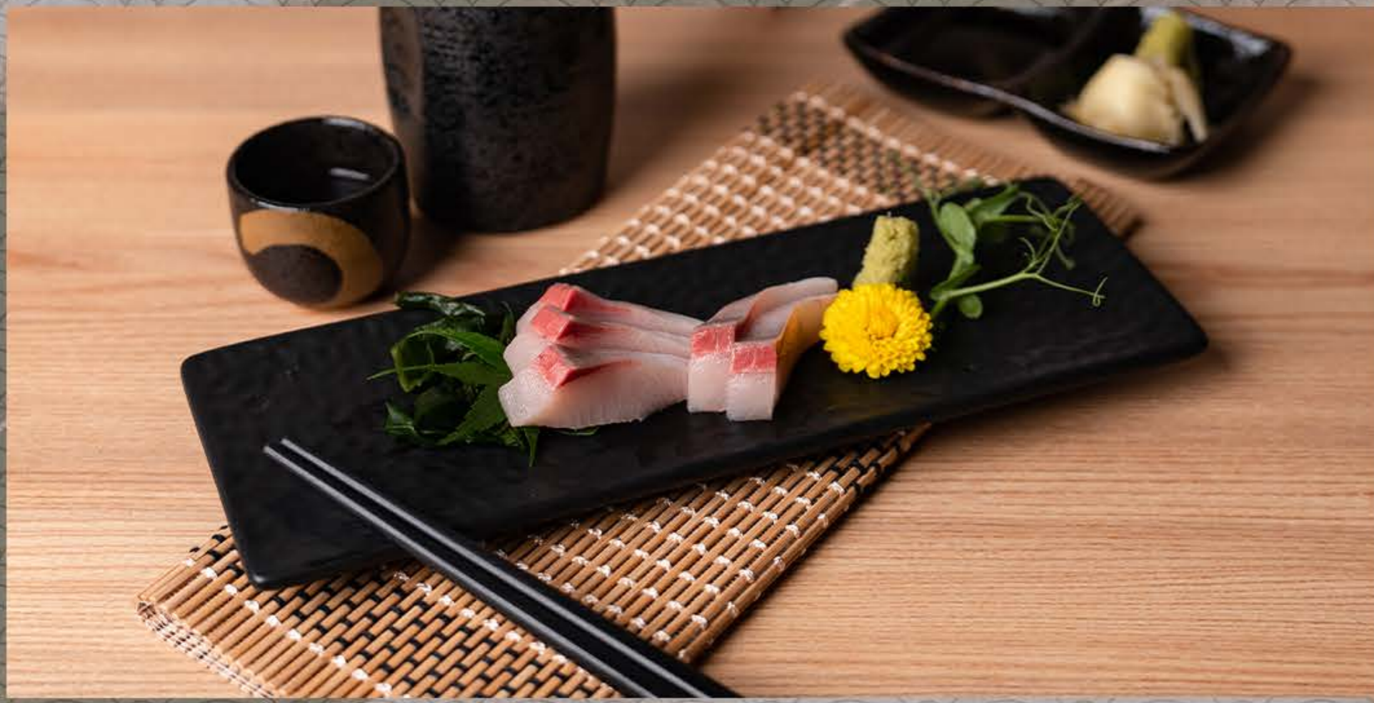
ハマチ Hamachi Yellowtail Fish with Buttery Texture $25