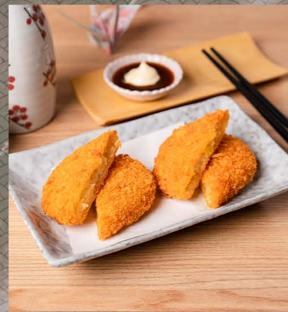
コロッケ Croquette Deep-Fried Potato Patty $6