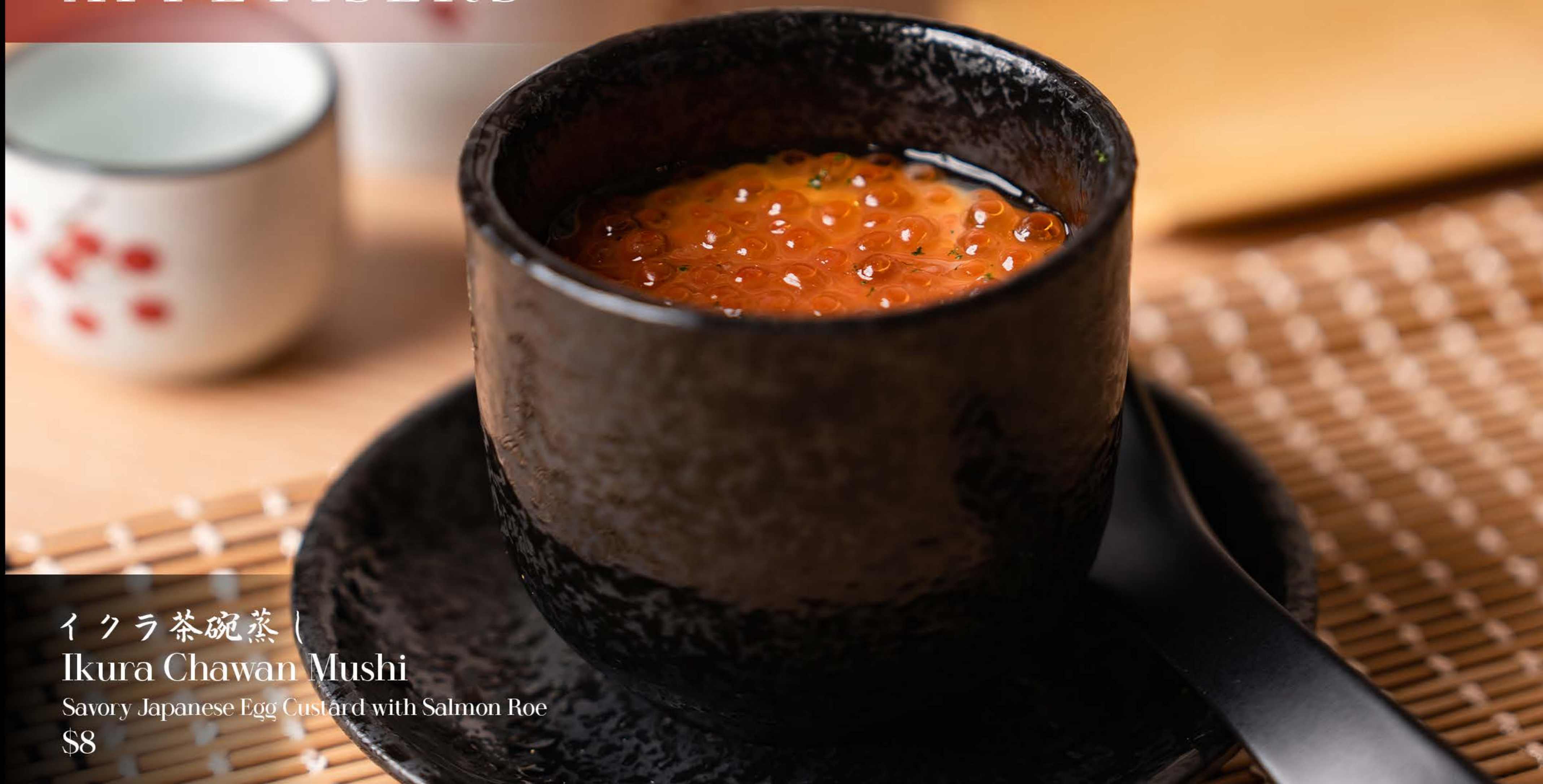
イクラ茶碗蒸し Ikura Chawan Mushi Savory Japanese Egg Custard with Salmon Roe $8