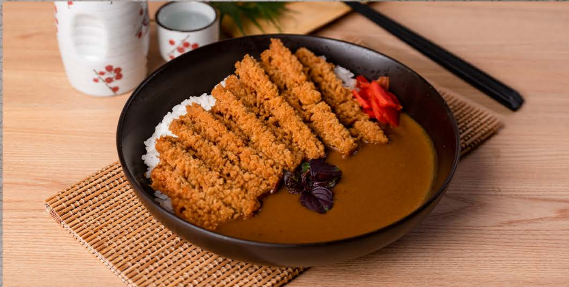
豚カツカレー Pork Katsu Curry Curry with Breaded Pork Cutlet $16