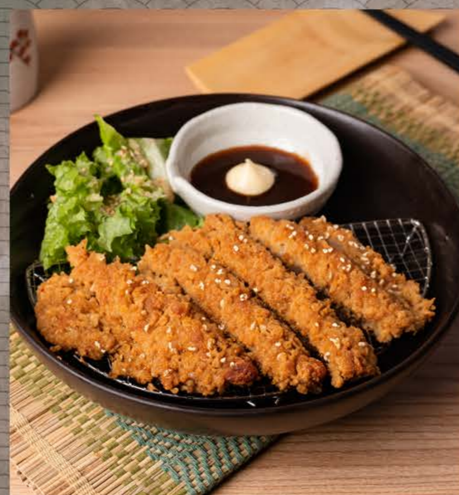
豚カツ Pork Katsu Crispy Breaded Pork Cutlet $13