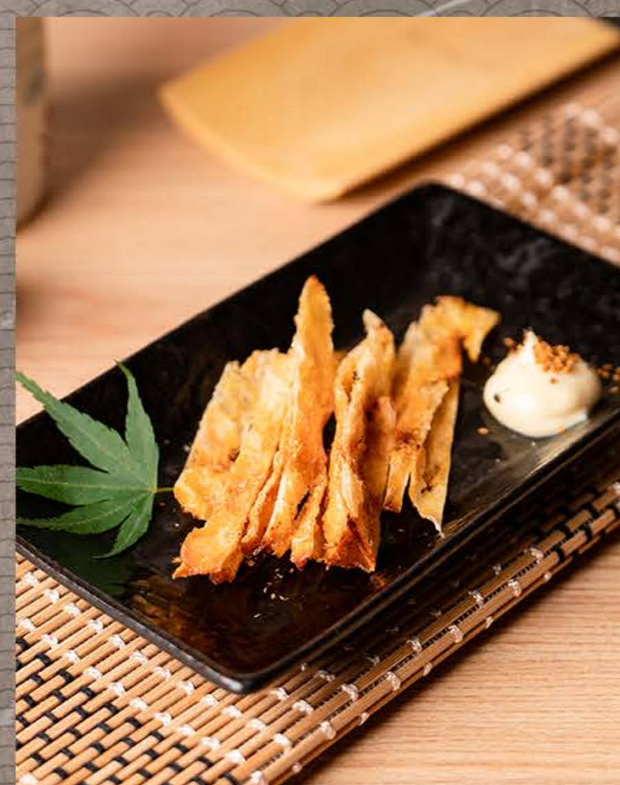
カワハギ Kawahagi Delicate flavored Kawahagi Fish $8