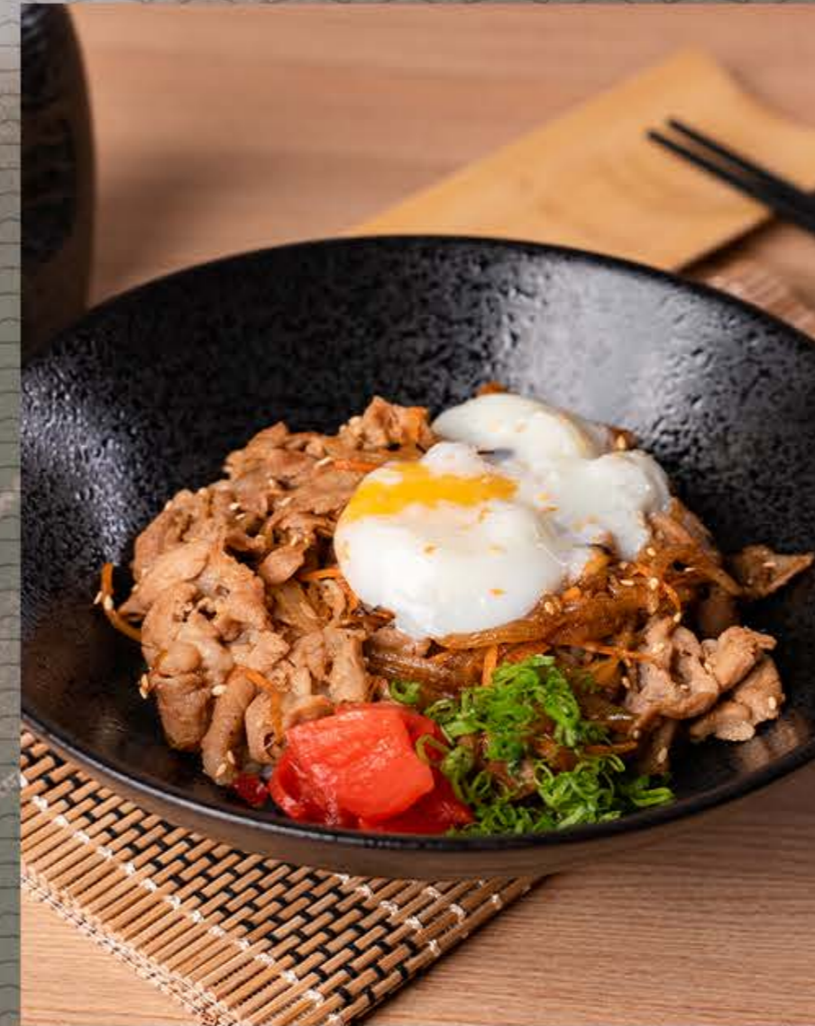
豚しょうが焼き丼 Pork Shiogayaki Don Pork Ginger Soy Sauce Bowl $16