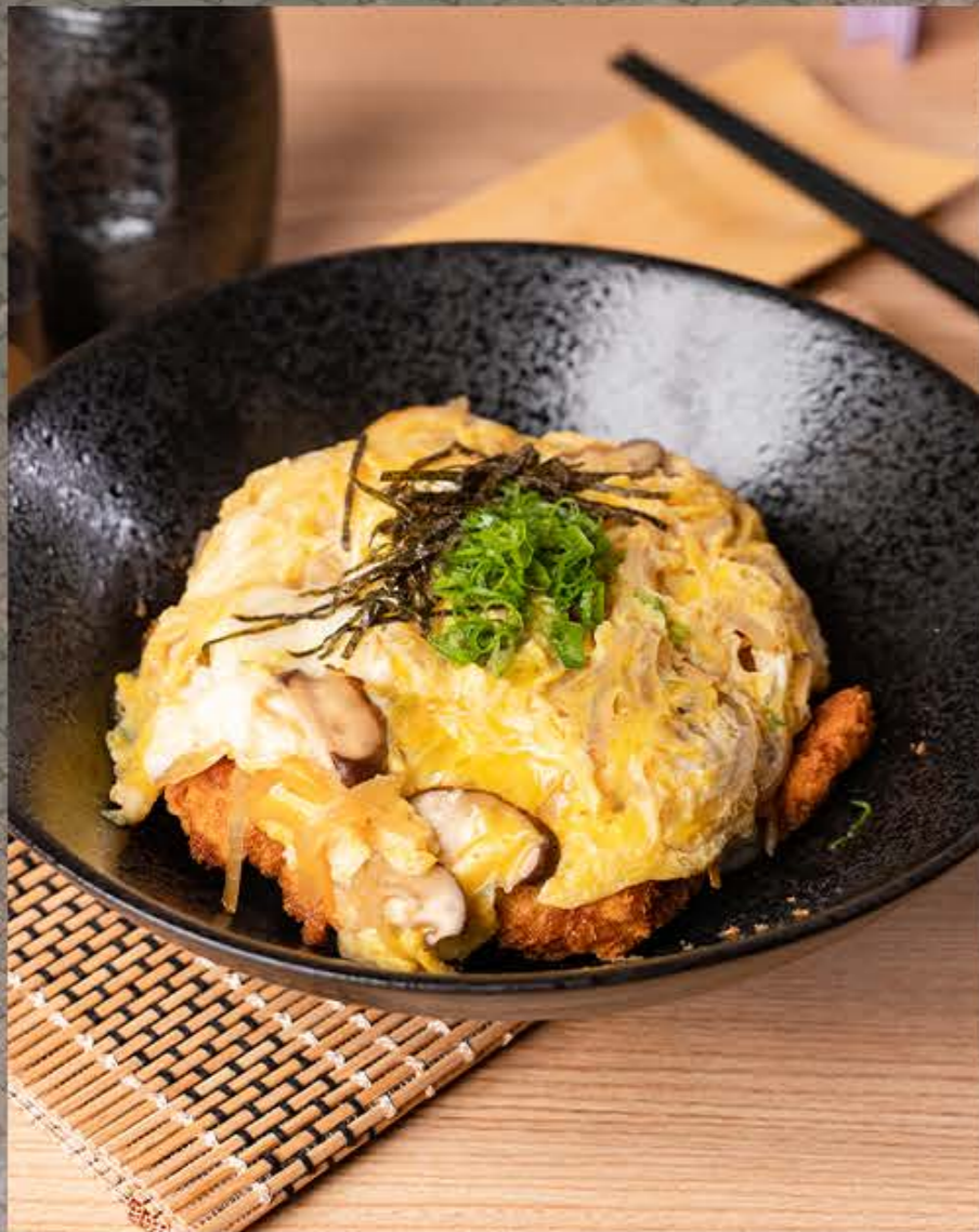
豚カツ丼 Pork Katsu Don Rice Bowl with Breaded Pork $16