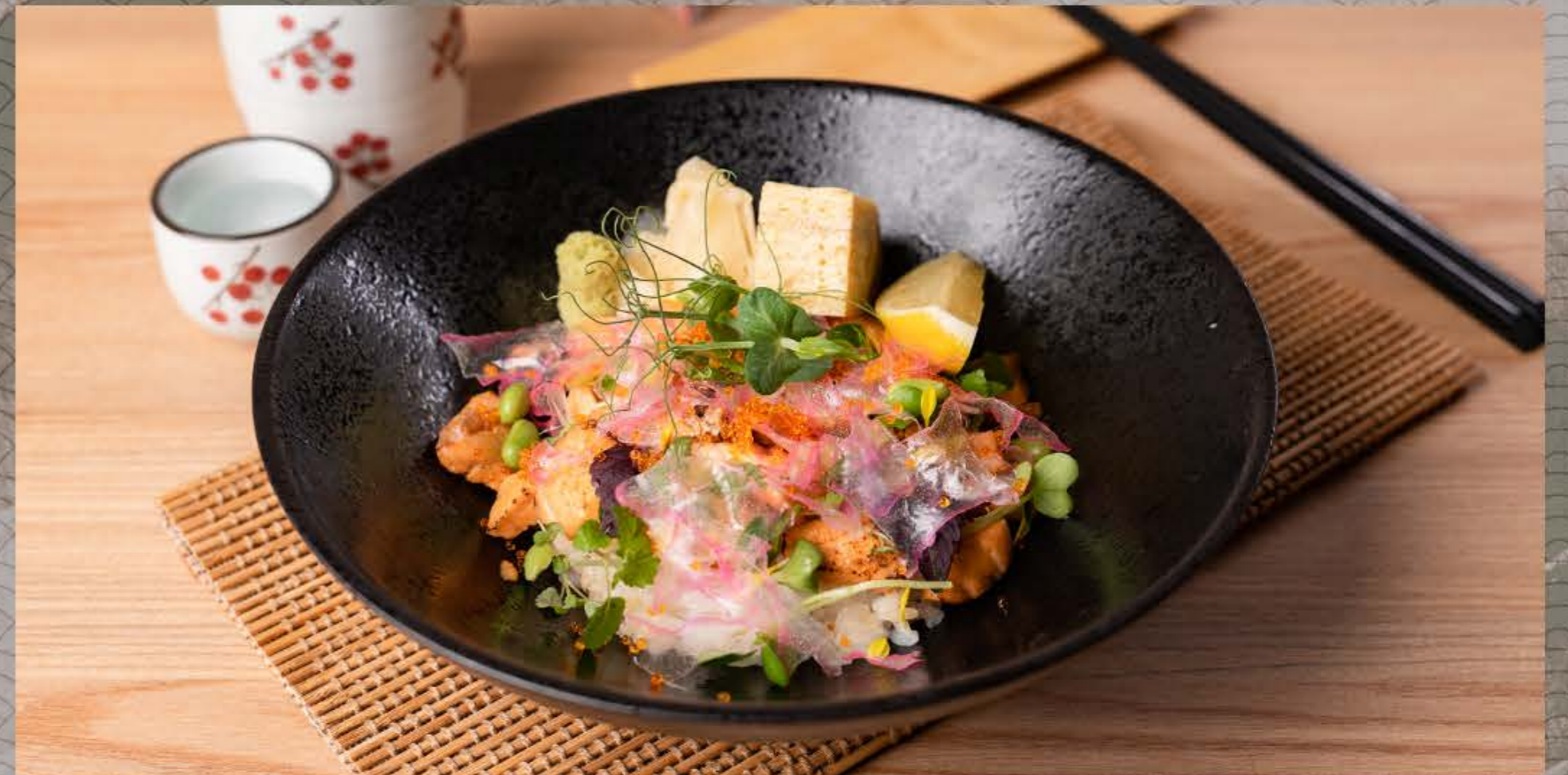
炙りサーモンバラ Aburi Salmon Bara Seared Salmon Slices over Rice $22