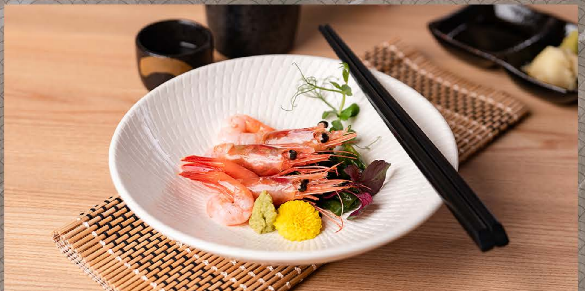
甘エビ Amaebi Sweet and Delicate Raw Shrimp $22