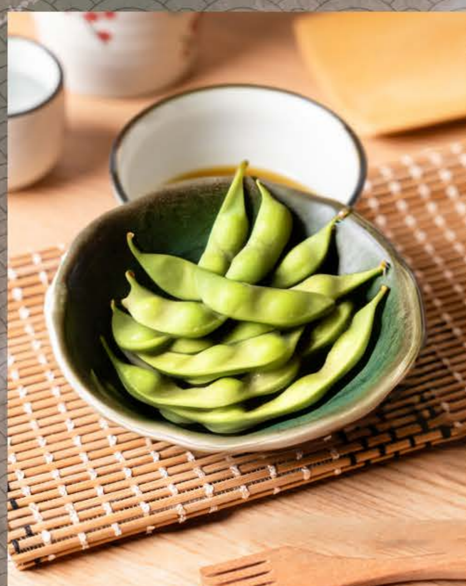
枝豆 Edamame Boiled Young Soybean Snack $5