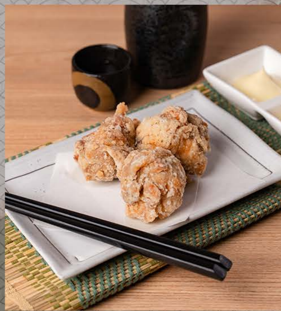
鶏唐揚げ Tori Karaage Fried Chicken Bites $10