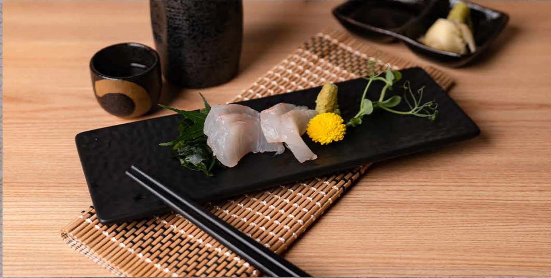
鯛 Tai Red Snapper with Delicate Flavor $28